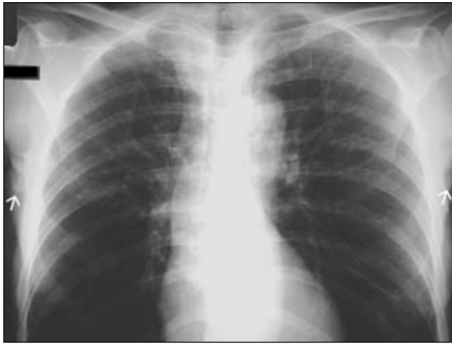
Figure 1) Plain chest radiograph showing emphysematous changes predominantly in the lower lung zones and the tortuosity of the aorta. Note the sagging, redundant folds of skin in the patient's axillae (arrows)