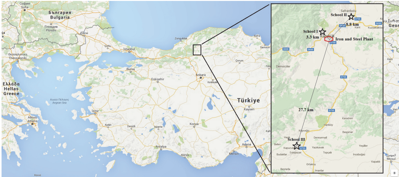
FIGURE 1: The location of the schools, according to the heavy industry area.

Many studies have confirmed that the dust emitted in the production of iron and steel is an important source of ambient air particulate matter in some areas [10]. The smelting process in the iron and steel industry is known to be a major source of ambient nickel, iron, vanadium, lead, copper, and zinc, and an association between the airborne concentrations of nickel, vanadium, zinc, iron, and FeNO has been reported [4]. Another study showed that the concentrations of all measured heavy metals in an iron and steel industry zone were 1–3.5 times higher than those measured in other areas [10].