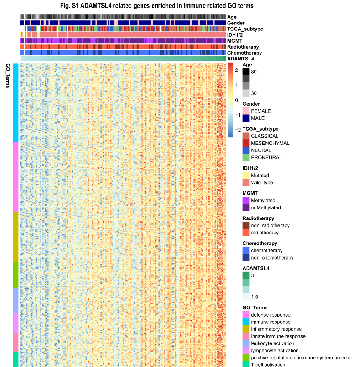
Fig. S1 ADAMTSL4 related genes enriched in immune related GO terms. Most immune process related genes were significantly positively correlated with ADAMTSL4 expression in the TCGA databases.