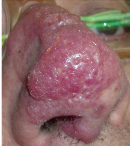
FIGURE 1: Close up view Erythematous macules, plaques, and rare nodules with irregular borders on the nose with superficial telangiectatic vessels.