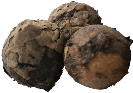
FIGURE 2: Tamanu nut. Dry tamanu nuts prior to extraction of the oil or extract. The shell of the nut is typically removed to reveal the white kernels from which oil is typically extracted.

directions for studies exploring the possibility of using tamanu oil for this disease.