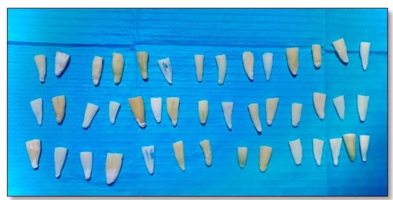
S3: Prepared 45 extracted

The fresh freeze-dried plant sticks of SP were extracted with petroleum ether extract by cold percolating 500 g of dried powder of the plant sticks in one liter of petroleum ether for 72 h, and every 24 h fresh solvent was used.