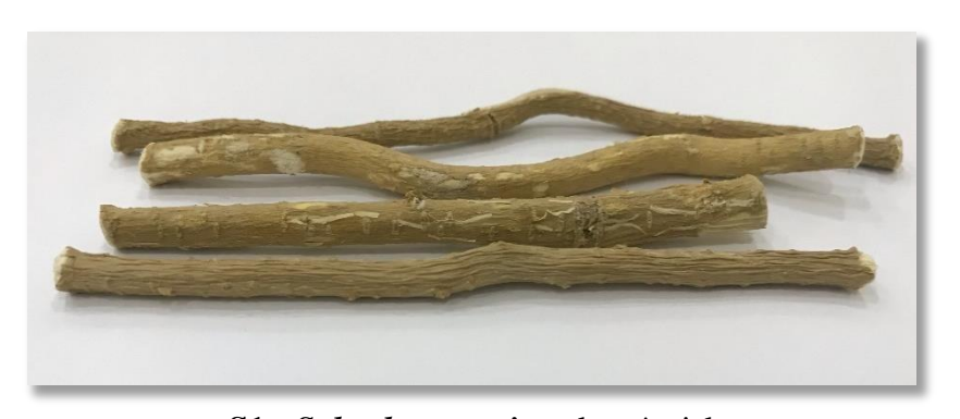
S1: Salvadora persica plants' sticks

Nahla Ayoub<sup>1*§</sup>, Nadia Badr<sup>2</sup>, Saeed S Al-Ghamdi<sup>1§</sup>, Arwa Alzahrani<sup>3</sup>, Rahaf Alsulaimani<sup>3</sup>, Afnan Nassar<sup>4</sup>, Rawabi Qadi<sup>1§</sup>, Ibtesam K. Afifi<sup>5,6‡</sup> Noha Swilam<sup>7‡</sup>