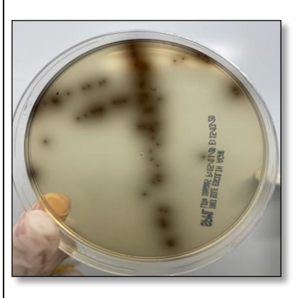
S8: BE agar showing high number of growing colonies of E. faecalis after using saline (CFU2)