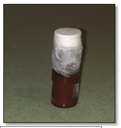
S2: Salvadora persica pet-ether Extract