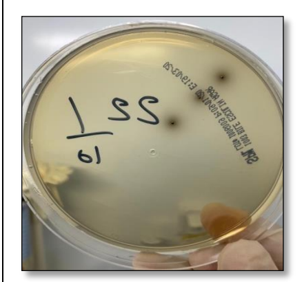
S7: BE agar showing few number of growing colonies of E. faecalis after application of Ca(OH)<sub>2</sub> (CFU2).