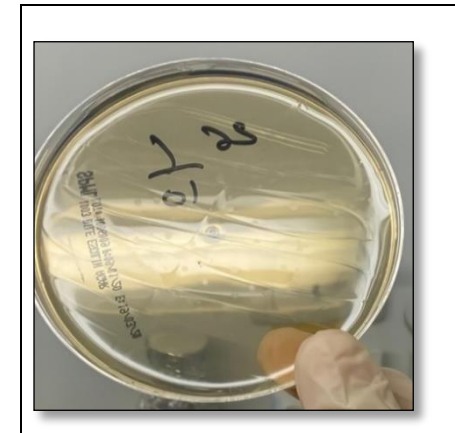
S6: BE agar showing no growing colonies of E. faecalis after application of Siwak as medicament (CFU2)