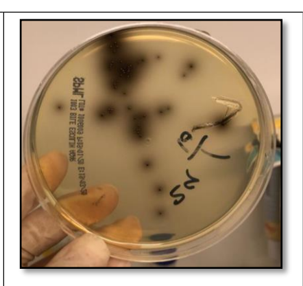
S5 : Bile esculin (BE) agar showing high number of growing colonies of E. faecalis before application of medicaments