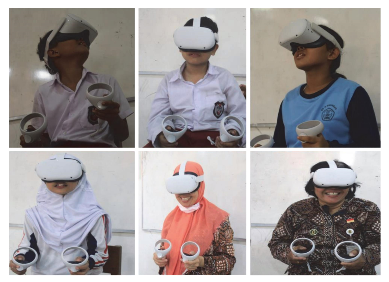
FIGURE 5: Teachers and students who try Zoo-VR.

(With discovery learning, students can be asked to observe certain animals up-close. They are looking at his physical shapes, such as the number of legs and body shapes. In addition, it can also be asked to observe how they move. What kind of voice? If they can supplement their knowledge by reading writings and listening to the voice of explanations.)