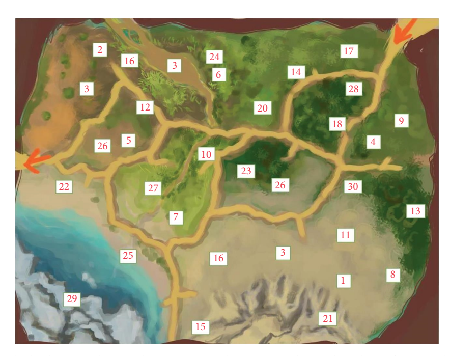
FIGURE 2: The landscape in the virtual environment. The number indicates the habitat of a particular animal.