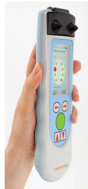
FIGURE 2: The infrascanner intracranial haematoma detector, model 2000.

treatments and diagnosis for traumatic brain injury not only rapidly but also well ahead of time [7, 8].