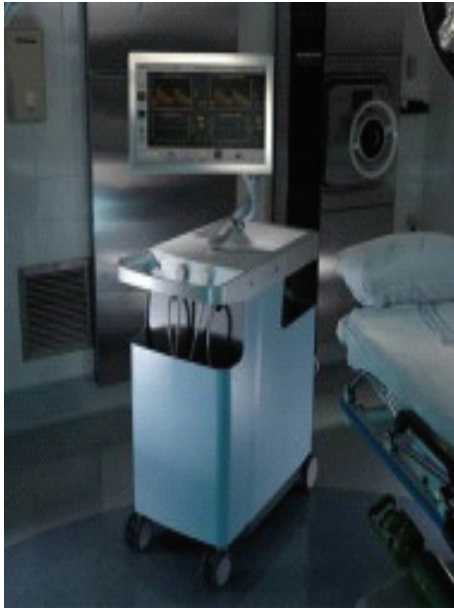
FIGURE 5: The “Presto” Cranial blood flow monitor.

decline 6 weeks after surgery. New clinical study results show that casmed's fore-sight technology provides superior accuracy and potential for improved outcomes. Decreased forebrain cerebral tissue oxygen saturation is associated with cognitive decline after cardiac surgery [22]. Subjects were given a battery of cognitive tests, both before and 6 weeks after surgery, for verbal memory and language comprehension, figure memory, attention and concentration, and psychomotor and processing speed. This observational study showed that decreased intraoperative SctO 2 levels are potentially associated with longer term forebrain postoperative cognitive decline. It is believed that this was the first study to provide initial evidence that longer term postoperative cognitive decline may be associated with decreased cerebral tissue oxygen saturation measured by cerebral oximetry [23]. This device measures blood oxygen in a similar manner to a finger clip pulse oximeter. Continuous near-infrared regional cerebral perfusion monitoring is provided in stroke patients. The sensors stick on like adhesive bandages above each of the patient's eyebrows and emit near-infrared light that penetrates the scalp and underlying brain tissue [24]. As with Clotbust, this device is easily used by nonspecialist physicians. The application of a simple sensor sticker provides essential information for the management of a stroke patient.