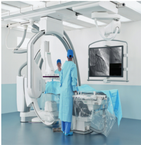
FIGURE 9: The Artis angiography system.

Patient transport and the need for the floor-mounted rails used in other systems are eliminated, opening up valuable OR space and allowing unimpeded movement of surgical equipment and simplified infection control. The system also offers the longest scanner travel range on the market today.