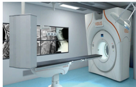
FIGURE 8: The ceiling-mounted intraoperative “VISIUS iCT”.

Remaining with the theme of diagnostic testing and computed tomography monitoring, the IMRIS CT (Figure 8) should be mentioned. IMRIS Inc. (IMRIS) designs, manufactures, and markets the VISIUS Surgical Theatre, a multifunctional surgical environment that provides intraoperative vision to clinicians. Designed to fulfil a hospital's clinical needs, the VISIUS Surgical Theatre can incorporate magnetic