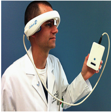
FIGURE 3: The Clotbust ER ultrasound system for thrombolysis.