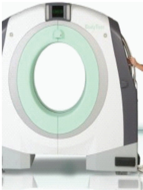
FIGURE 7: The “Bodytom” portable full body CT scanner.

BodyTom can be transported from room to room and is compatible with PACS, surgical navigation, electronic medical records, and planning systems. Its unique capabilities provide high quality CT images wherever needed, including the Clinic, ICU, operation room, and Emergency/Trauma Department. The combination of rapid scan time, flexible settings, and immediate image viewing makes the BodyTom a valuable tool to any facility needing versatile real-time CT imaging [29].