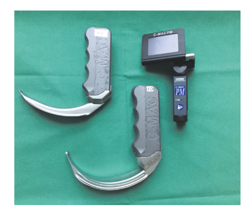
FIGURE 1: C-MAC PM<sup>®</sup>. C-MAC PM<sup>®</sup> videolaryngoscope (right), D-Blade<sup>®</sup> (middle), and Macintosh blade size 3 (left).

Preoperative airway evaluation was carried out by assessing the Mallampati score, thyromental distance, cervical spine clearance, and interincisor distance. Difficulty was defined as a Mallampati score III or IV, thyromental distance of <6.5 cm, reclination of <30°, an interincisor distance of