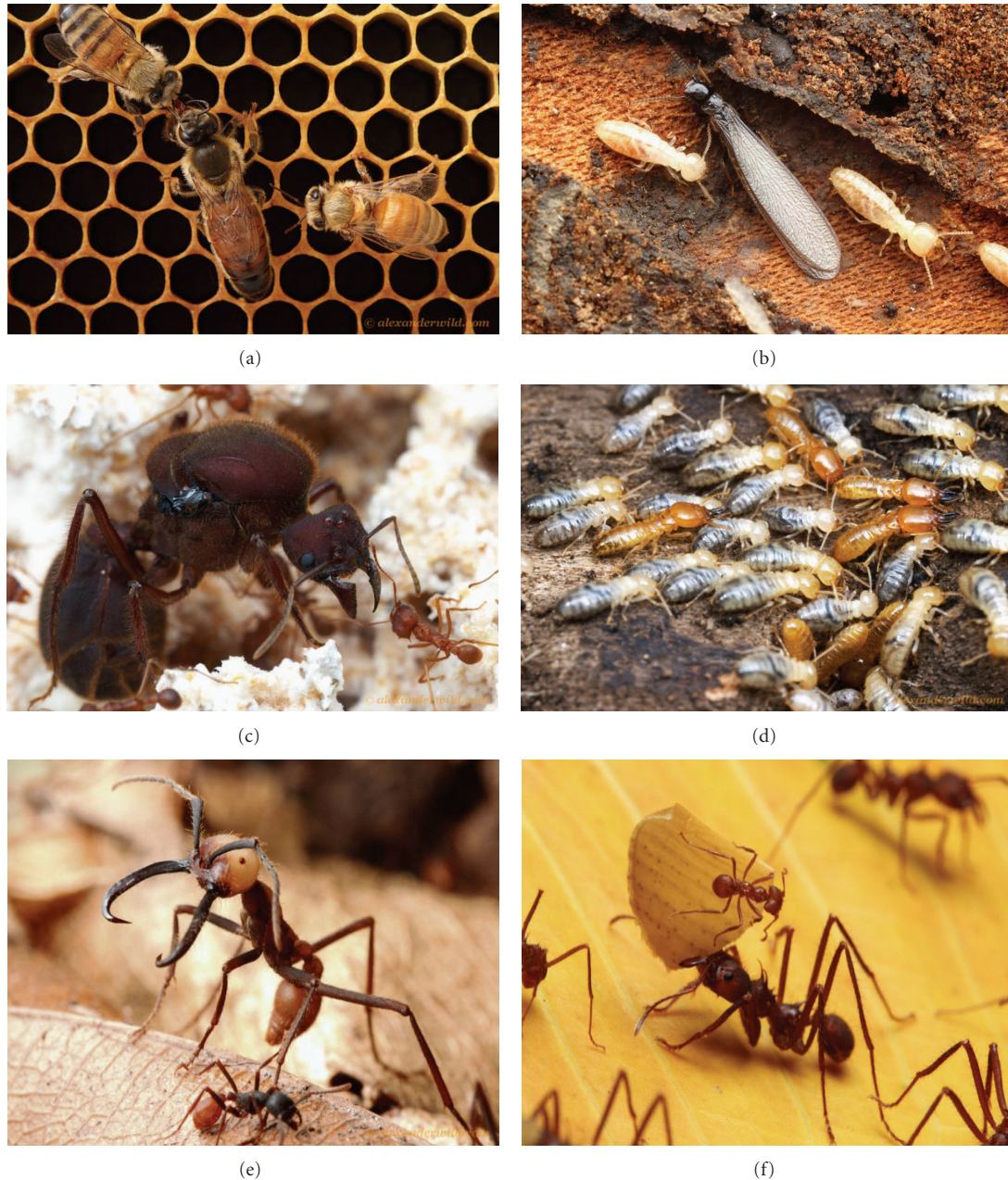
FIGURE 1: Examples of striking phenotypic plasticity between castes in the social insects. (a) Honey bee queen (center) and workers. (b) A winged reproductive termite Reticulitermes flavipes (center) and nonreproductive workers. (c) Queen leafcutter ant Atta texana (center) and a daughter worker (left). (d) Soldiers (with larger mandibles) and workers of the termite Prorhinotermes inopinatus . (e) An army ant Eciton burcellii soldier (center) and minor worker (bottom). (f) Major and minor workers of the leafcutter ant Atta cephalotes .

vastly different body proportions and morphological characters compared to workers (Figure 1). How could such different phenotypes (castes) evolve if workers leave no descendants upon which natural selection can act? In some ant species, these caste systems are even more striking, with the presence of two or more types of morphologically distinct workers (e.g., specialized soldiers, major, and minor worker castes, Figure 1, [10]).