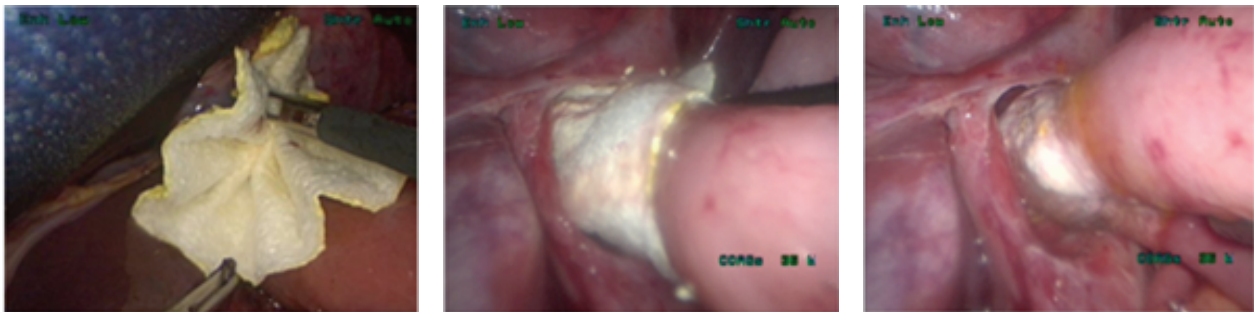
FIGURE 2: Strengthening the esophagojejunostomy with a TachoSil patch. Application by means of folding the patch in a harmonica shape.

by gently pulling either side of the patch. The patch was slowly advanced over the anastomosis and wrapped around it. To ensure adhesion, pressure was applied to the patch. No learning curve was found for TachSil application in these patients.