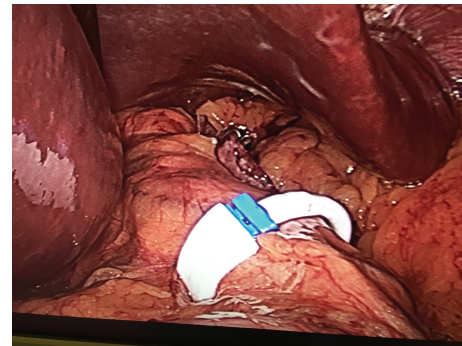
FIGURE 2: Laparoscopic Sleeve Gastrectomy with GaBP Ring Autolock™ System.

All procedures performed in studies involving human participants were in accordance with the ethical standards of the institutional and/or national research committee and with the 1964 Helsinki declaration and its later amendments or comparable ethical standards. The study was approved by the local ethics committee.