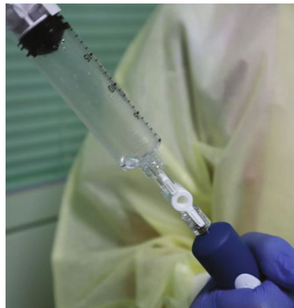
(c) After the subepithelial tumor was punctured, the lock on the syringe was opened. The saline flowed into the suction syringe due to the negative pressure