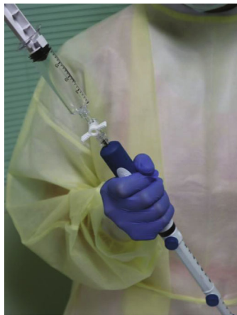
(b) A locked suction syringe with 20 mL of negative pressure was attached to the needle