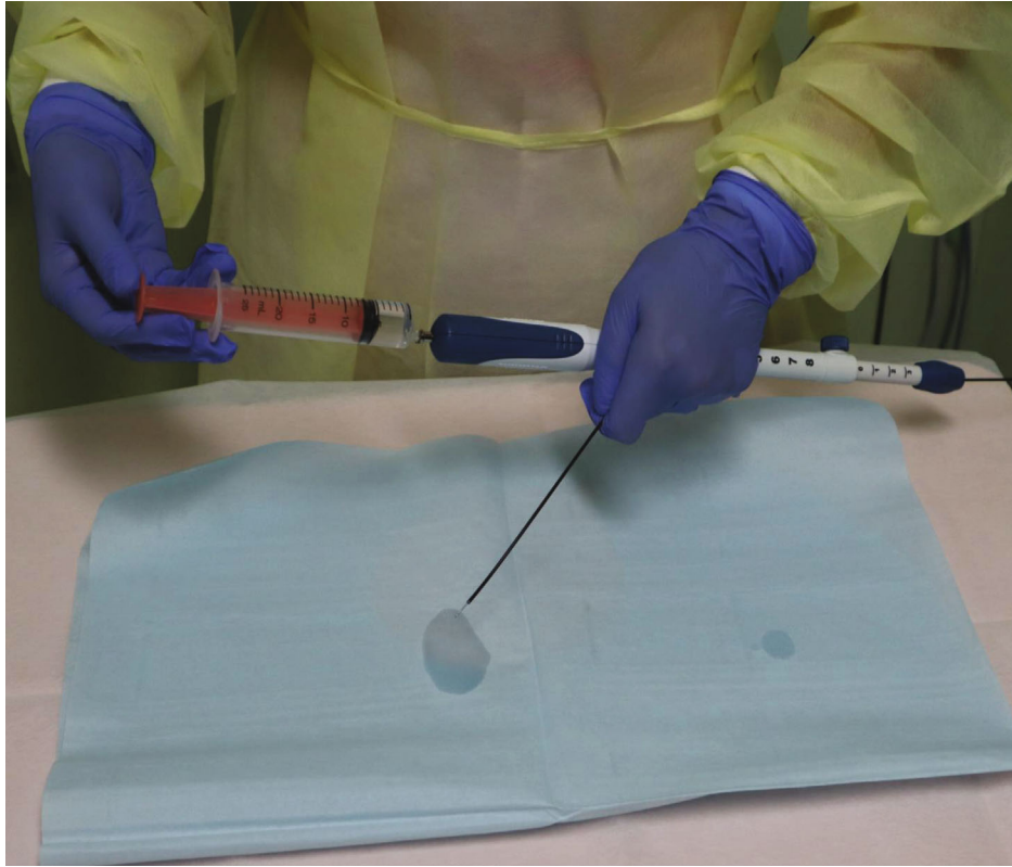
(a) After the stylet of the needle was removed, saline was injected into the needle to replace the column of air