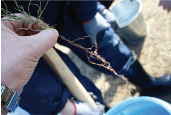
FIGURE 1: Method of planting-application of hydrogel suspension to the roots of pine seedlings.

Agrogel is a polymer granule, which may also be manufactured as a powder, that swells and becomes gel-like when diluted with water. When you apply hydrogel to the root zone of plants, it continually supplies the plant with the proper amount of water. Changes in soil moisture do not stress the plant. 1 g of agrogel may hold 50–300 ml of water. Agrogel is absolutely harmless to both plants and people.