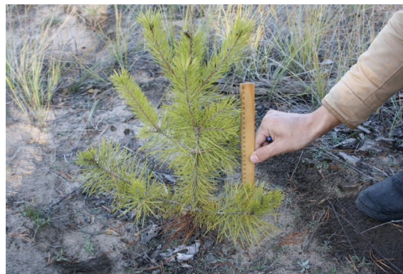
FIGURE 3: Photo of pine trees in plot 1 in the second year after planting.