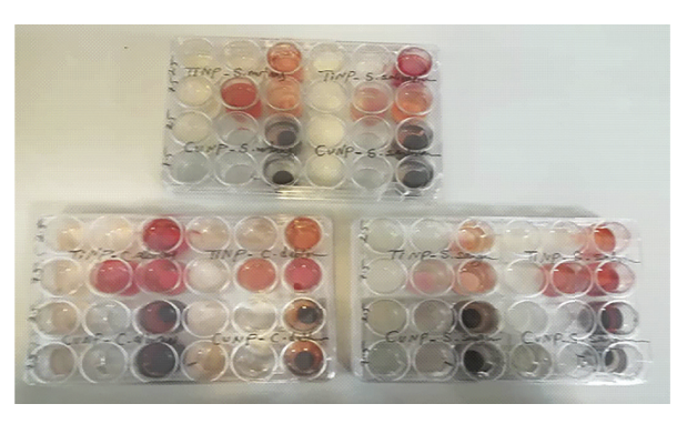
FIGURE 1: 24-cell plates containing acrylic specimens.

inhibition of the study groups for each strain of Streptococcus and Candida are presented in Tables 1 and 2. The higher optical density and lower percentage of biofilm inhibition shows lower antimicrobial activity against specific strain.