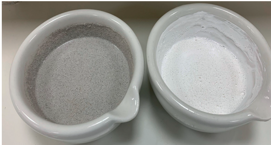
FIGURE 1: Preparation of experimental quail toothpaste and control toothpaste.