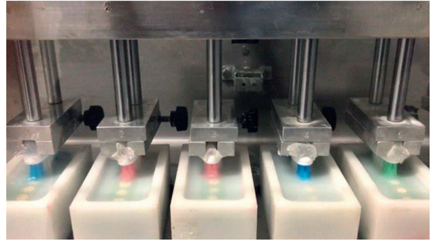
FIGURE 1: Plastic tubs with the dies accommodated, fitted to the brushing machine.

There was still a statistical difference between the groups at 1, 30, and 60 days. On the first day, this difference was representative between groups NPHAp and BAG, with greater loss of mass for the BAG ( p = 0.016 ). At 30 days, the BAG group showed greater statistically significant mass loss compared to the control and NPHAp ( p \leq 0.001 ). At 60 days, the NPHAp group presented higher mass, being statistically different from the Control and BAG groups ( p \leq 0.001 ).