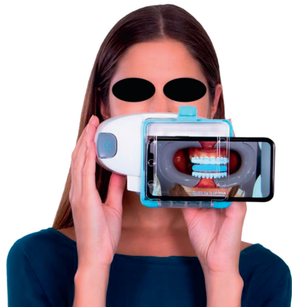
FIGURE 2: Dental Monitoring system. This smartphone-based app allow patients to scan directly their teeth and provide instantaneous feedback of treatment progress to the clinicians and orthodontic office. The patient insert the smartphone into the ScanBox that allows a more predictable scan procedure.

Recently, a smartphone application software for remote monitoring, Dental Monitoring (Dental Mind, Paris, France), has been launched on the market [25]. This is the first SaaS (software as a service) application designed for remote monitoring of dental treatment. The digital technology involved allows the software to track tooth movement by using the images of scanned videos taken by the patients with smartphone cameras (iOS or Android). Briefly, each video scan consisted of three sets of images taken by the patients with the cheek retractors in place. In the first two scans, the patient is asked to turn the head side to side to capture the anterior and lateral segments of dentition, first with the teeth in occlusion and then with both arches slightly apart. In the third set of images, the patient registers the occlusal views of the arches by changing the angle of the smartphone camera while moving the head up and down with the jaws wide open. The package included specific cheek retractors used by patients to facilitate scan acquisition (Figures 2 and 3). The monitoring software makes it possible to track treatment progress between office appointments, prompting clinicians when specific outcomes have been reached such as space closure, space opening, or dental