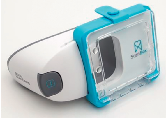
FIGURE 3: Closed view of the ScanBox shell.

issues are detected, such as a broken appliance, poor hygiene, or gingival recession [17, 25].