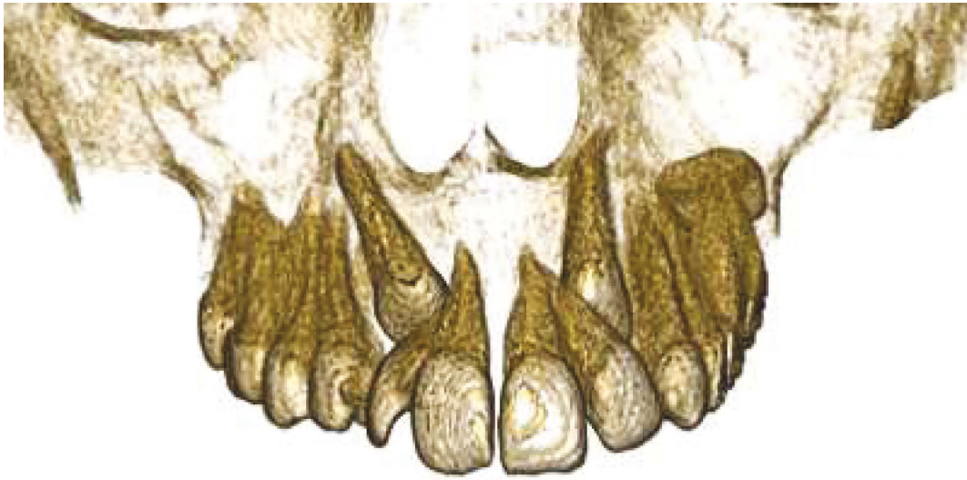
FIGURE 1: Bilateral impaction of maxillary canines.