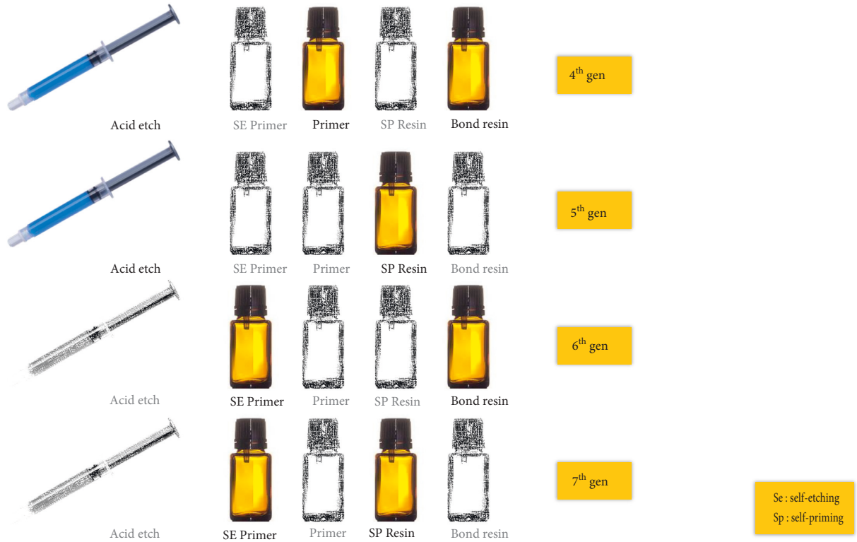
FIGURE 3: There was a hint for each question, which included snippets from lecture slides, scholarly articles, and textbooks. In the figure is a hint for Question 1 (across): “The adhesive system that first introduced the dual-cure activator.”