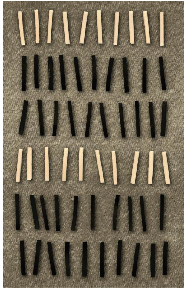
FIGURE 1: All prepared samples.

2.2.1. Preparation of CGIC Samples. According to the manufacturer's instructions, a scoop of CGIC powder,