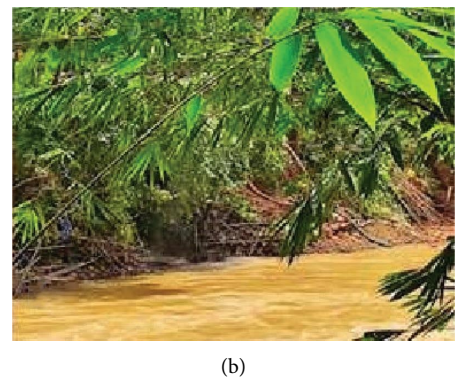
FIGURE 3: (a) Illegal gold mining activity and (b) brown-yellowish water river color after receiving mining waste.

parameters, and the plankton community structure. This was indicated by increased numbers of species and individuals and the plankton diversity index in ST-5 and ST-7. This is in line with the research by Ma [32], which states that human activities play important roles in catchment area disturbance worldwide in terms of the physical and chemical parameters of rivers. Therefore, most aquatic species are under big threat because of human influences.