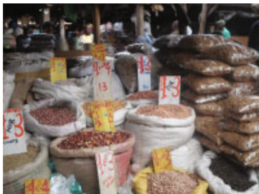
FIGURE 1: Agricultural produce on display at Mbare musika market including peanuts.