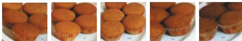
FIGURE 1: The surface color of prepared cupcake samples containing of PPP.