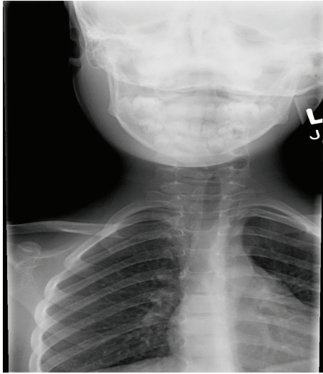
FIGURE 1: Soft tissue radiograph of the neck with deviation to the left and narrowing of upper airway.

the emergency department, he looked unwell with fever of 38.9°C, right neck and jaw swelling with multiple right cervical lymphadenopathy, the largest measuring 3 cm, with overlying erythema. He also resisted neck movements due to pain. The rest of the examination of oropharynx, ears, and nose as well as other systems were within normal limit.