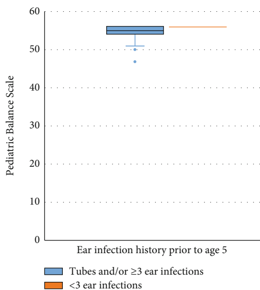
FIGURE 2: Pediatric Balance Scale score by the study group.

introduces the possibility of examiner bias. Future investigators should consider recruiting children with a history of tympanostomy tubes, children with multiple ear infection history that have low activity levels, and having participants' parents supply medical records regarding the history of tympanostomy tubes and ear infections. In addition, participants in both groups were physically active. Future investigators should consider recruiting participants with lower activity levels as physical activity level may positively impact postural stability in children with tubes and/or 3 or more ear infections prior to age five.