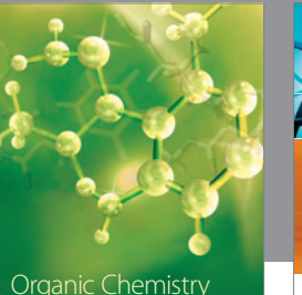
Organic Chemistry International