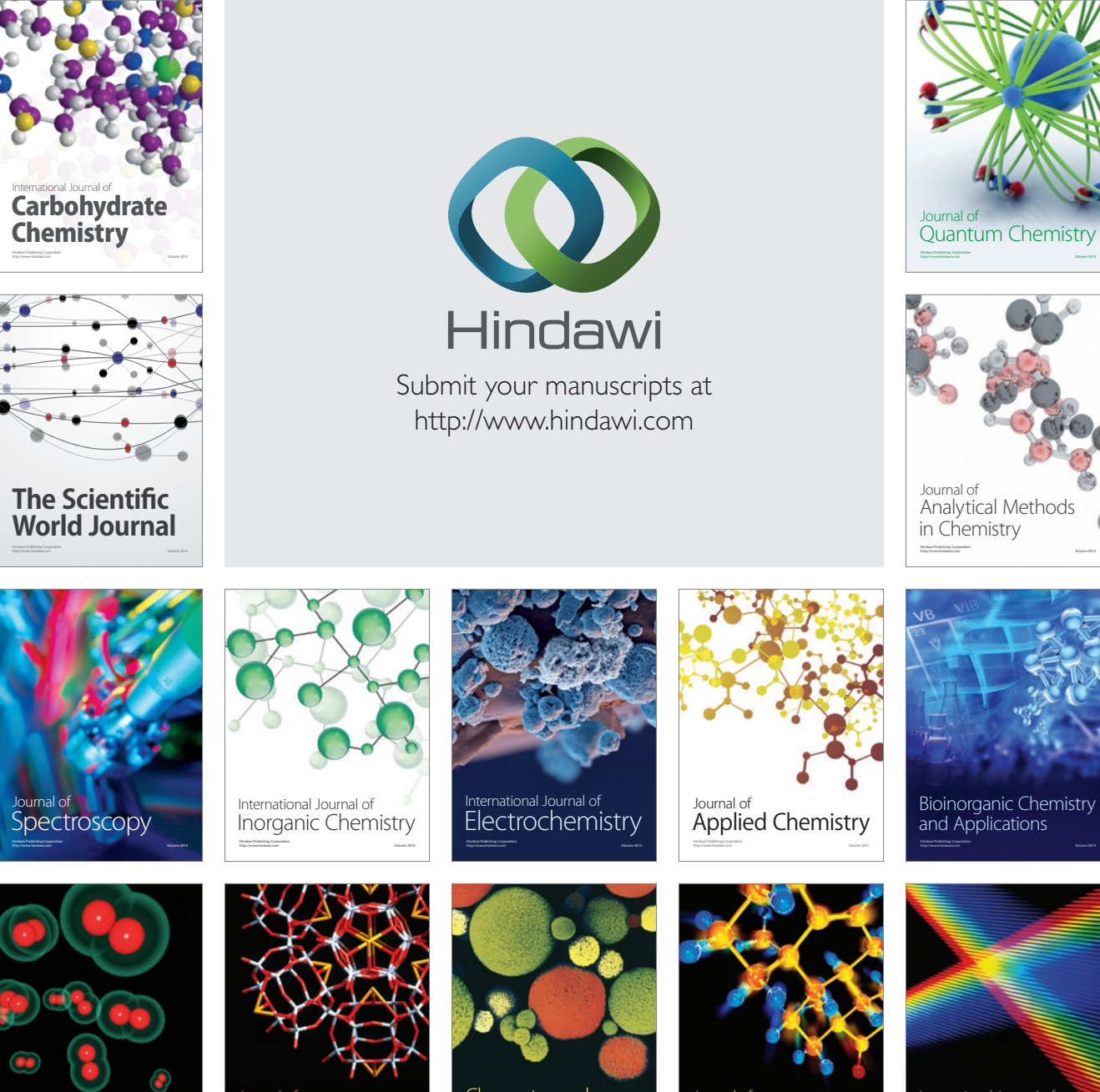
Journal of Theoretical Chemistry