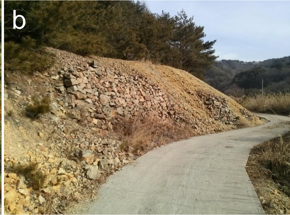
Figure S2. Overview of the mine tailing dumps located in the study area. a) Top and b) sides of the mine tailing dumps.