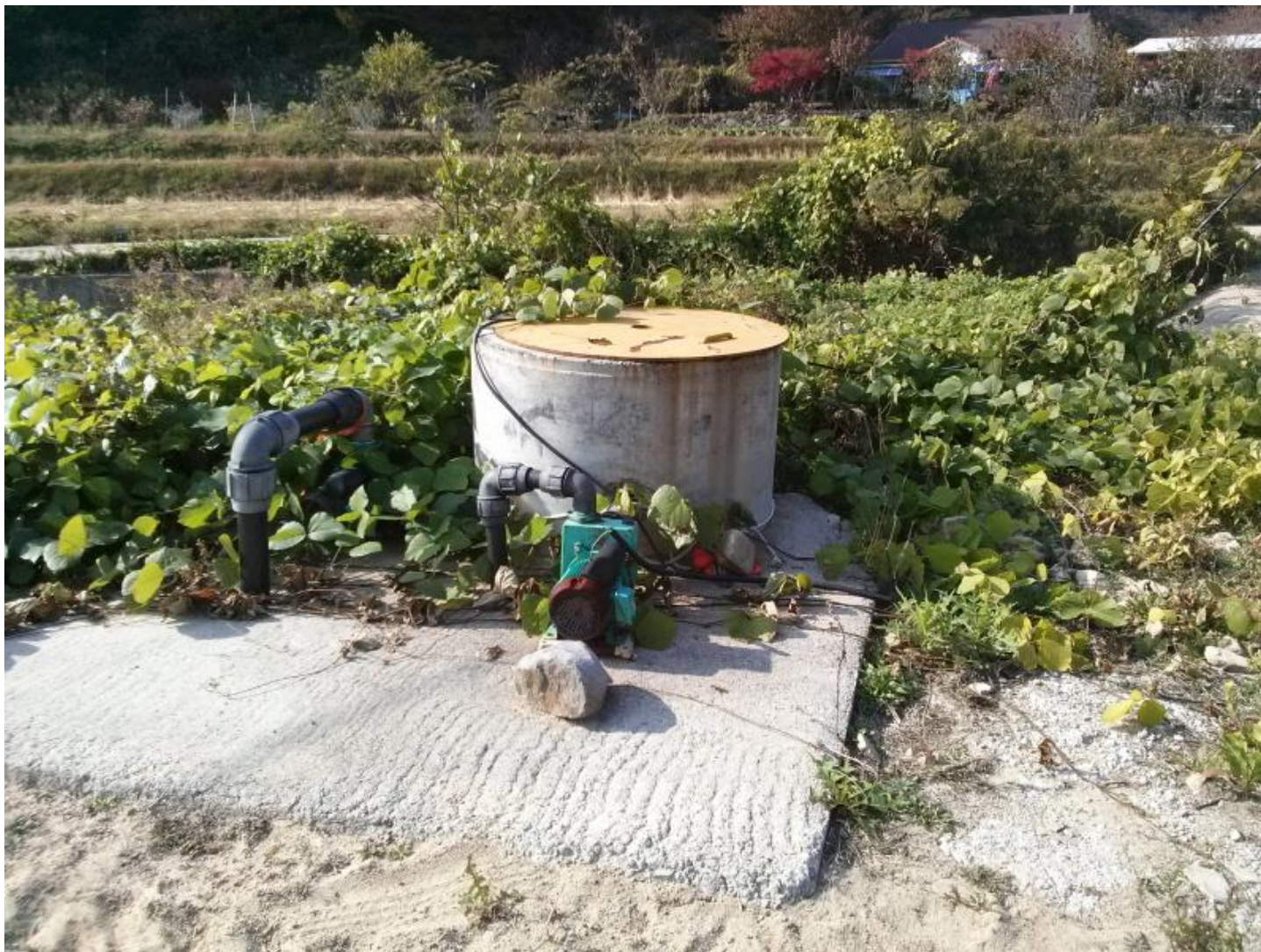
Figure S1. Overview of the pumping well for irrigation in the study area.