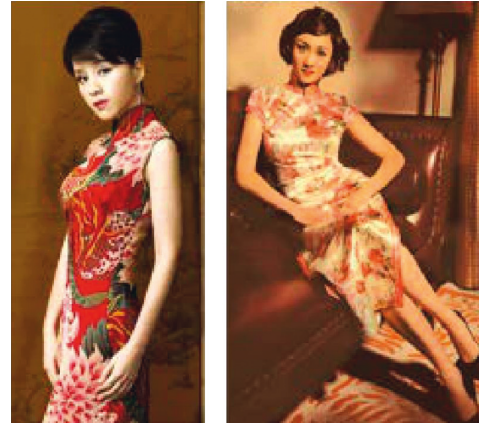
FIGURE 1: The representative of oriental clothing—cheongsam.

3.3. Differences in Clothing Colors. Color plays an immeasurable role in the aesthetics of clothing; it is an indispensable part of clothing, but also an indispensable part of people’s lives. Studies have shown that people’s sensitivity to clothing color is greater than people’s sensitivity to the shape of clothing, so color has a very important position in clothing. People’s most primitive instinct is to decorate clothing with color, which also shows the importance of color in clothing for people. “The color of Chinese clothing is more ethical, requiring clothing to maintain social order; the color of Western clothing is more emotional, and attaches importance to the regulation of people’s psychology by clothing [14].”