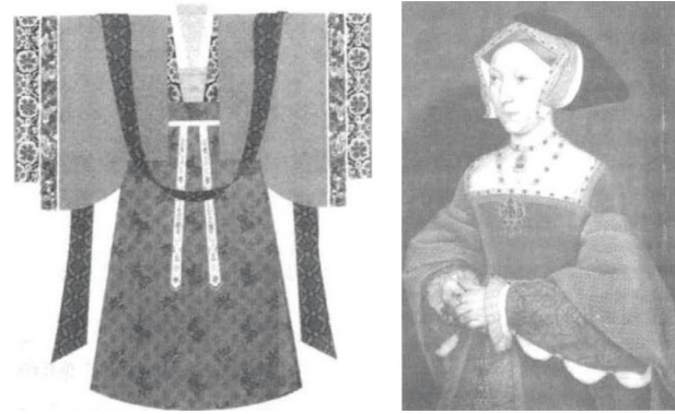
FIGURE 5: Costume modeling under the background of Chinese culture and western culture.

Due to the continuation of ancient Greek and Roman cultures and the intersection and fusion of classical, Christian and Germanic cultures over the centuries, clothing has moved from a loose style to a composite style. That is, the clothing structure has undergone a process from simple to complex, from flat to three-dimensional. This three-dimensional form has been maintained and continued for thousands of years in the history of Western clothing, so that the Western clothing form has become a shape based on plastic, and strives to express the three-dimensional cutting method of the human body, whether it is hung in the closet or worn on the body, or walked up, always maintaining a relatively static three-dimensional geometric space effect. This reflects the Westerners' exploration of space, with an obvious psychological motivation of "self-expansion," increasing the volume of clothing shapes, eager to occupy more space, and regarding clothing as a tool to expand their own body shape. This exaggerated costume shape maintains a certain distance between people and the whole of nature,