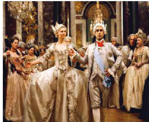
FIGURE 2: Clothing styles in the middle ages in Europe.

This is because Chinese value the whole, while Westerners care about the individual. Chinese focus on the whole and ethics, while the West cares more about what the individual wants as shown in Tables 1 and 2. Therefore, the difference in the choice of clothing color can reflect the difference between Chinese and Western cultures [15].