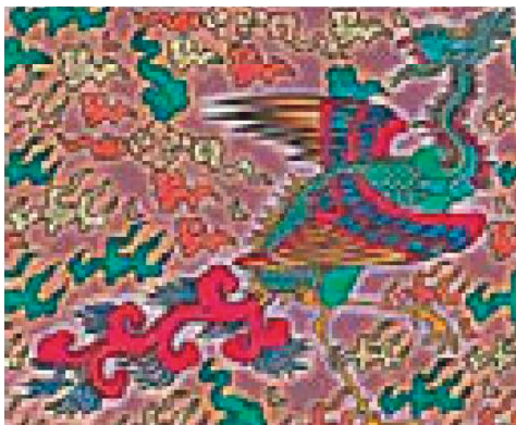
FIGURE 4: The unique artistic features of the east.

pursue in color matching. China's feudal hierarchy was strict, the royal aristocracy was extremely high, and the imperial power was supreme. We can clearly find from the color of clothing: any color that is favored by the royal nobility is forbidden to be used by the people, and if it is violated, it will lead to the disaster of killing. Conversely, if a color is abandoned by the royal family, then the color will also be regarded as a despicable color by the common people. To sum up, in ancient China, the choice of clothing color came from the submission to the feudal etiquette system, and the common people had a reverential and yearning heart for the right color [19].