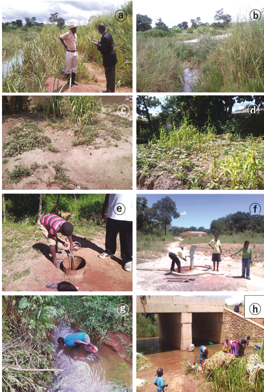
FIGURE 2: Stunted crops in gardens and surface and underground water of poor quality due to mine and metallurgical industries waste: interaction with the affected population showing (a) discussion with a concerned member of the community; (b) vegetation dying around a polluted river bank close to a mine site in Lubumbashi in the DRC; (c) stunted maize intercropped with pumpkin vegetables in Luanshya in Zambia; (d) sweetpotato in poor growth in Lubumbashi in the DRC; (e) a young boy fetching contaminated underground water from an open borehole for use at home in Lubumbashi; (f) a closed borehole with a pump for many village residents in Kitwe in Zambia; (g) a woman relying on surface polluted drinking water from a nearby gallery forestry source; and (h) women washing clothes and bathing in a polluted river in Lubumbashi in the DRC.

prospects that mining is said to provide for communities. Respondents for participation in the study were done with the objectives to determine social, economic, and health issues communities are facing in relation to environmental pollution from mining and metallurgic industries. Diverse