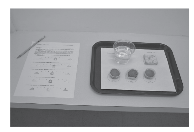
FIGURE 1: Sensory evaluation ballot and tray setup. Each panelist received a ballot, pencil, and tray with three muffin samples presented in a randomized and balanced order, two saltine crackers, and drinking water to cleanse their palates between each muffin sample.

All muffins were prepared by the principle investigator and culinary science students in the TWU Food Product Development lab. The muffin batter was prepared by combining all dry ingredients (all-purpose flour, BSG flour, sugar, leavening agent, and spices) in a bowl. In a separate bowl, all wet ingredients (unsweetened applesauce, olive oil, egg, and natural flavors and colors) were mixed together using an electric mixer at medium speed for 1 minute. The mixed dry ingredients were incrementally added to the wet ingredients while using an electric mixer at medium speed until fully combined (approximately 2 minutes). Paper muffin liners were added to muffin pans, and 15-16g of batter added to each paper-lined well and baked at 350°F (177°C) in a convection oven (Blodgett, Burlington, VT) for 10 minutes (0% BSG), 11 minutes (20% BSG), and 14 minutes (30% BSG). Higher fiber contents can increase viscosity and influence the homogeneity of muffin batters, thereby requiring longer cooking times to bake BSG muffins completely. Different cooking time instances were applied to minimize textural and gummy consistency differences between the muffins. Each formulation created 50-54 muffins per batch. Fresh muffin samples were prepared 24 hours in