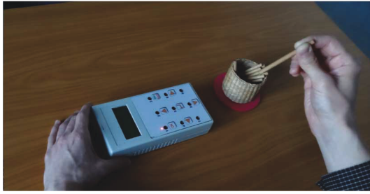
FIGURE 1: The s-9HPT and the peg holder aligned for a right-handed person.

There is another test that diverges slightly from this process: the random test (RAT). Here, the device might request that the subject, while in the process of inserting pegs, remove a peg before all nine have been inserted. During RATs, an unlit LED, while all other eight LEDs are illuminated, is used to signify that the corresponding peg should be removed.