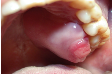
FIGURE 1: Primary extranodal non-Hodgkin lymphoma: painless mass involving the left palate.