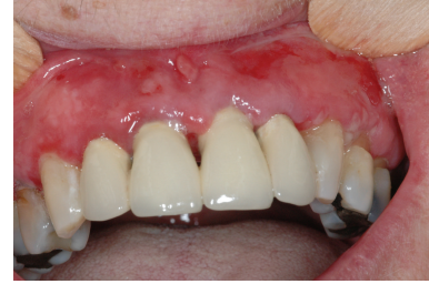
FIGURE 3: Paraneoplastic pemphigus: multiple erosions affecting the marginal gingival.

2.3. Group 3: Primary Systemic Lymphoproliferative Disorders That May Eventually Invade Oral Cavity. In addition to entering into this category, the previously treated lymphoproliferative disorders, where the diagnosis of oral lymphoid malignancy was subsequent to an indication of their early sign, mentioned in this regard a clinical-pathological entity of which we have evidence in the literature for over a century of mycosis fungoides (MF), chronic lymphoproliferative disorder with predominantly cutaneous involvement characterized by the proliferation of T lymphocytes that in