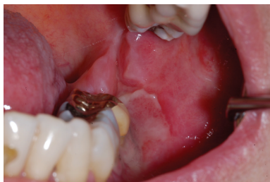
FIGURE 5: Oral cGVHD: ulceration of the buccal mucosa.

Autologous Transplantation. Oral complications are observed in 85% of cases of patients after autologous bone marrow transplantation (ABMT). These complications are due to the effects derived from antineoplastic chemotherapy and radiotherapy. Infections occur during the period of severe marrow aplasia and may be secondary to the conditions of the oral cavity before the transplant. Patients treated for lymphoproliferative disorders are at increased risk of relapse of the primary disease so as to develop subsequent tumors both hematologic [106] and nonhematologic in this regard we consider the oral squamous cell carcinoma as a second primary solid tumor after allogeneic transplant [107].