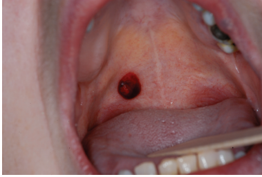
FIGURE 4: Thrombocytopenia: traumatic hematoma of the soft palate.

Oral lesions in paraneoplastic DM (leukoerythroplasia and ulcerative lesions) have rarely been described in the literature [76–79]. The DM is totally resolved if the underlying disease is treated and the resurgence of DM expresses relapse of malignancy [76, 79].