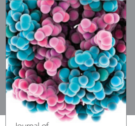
Journal of Diabetes Research