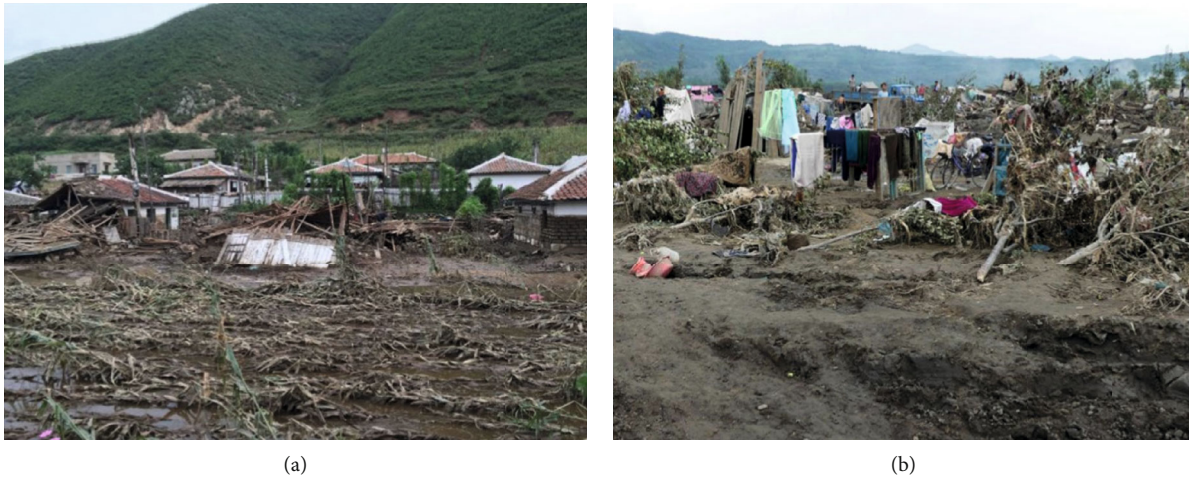
FIGURE 3: Damage from water-related disasters in North Korea: (a) flood of Hwanghae Province in 2015 [10] and (b) flood of North Hamgyong Province in 2016 [11].

classified into the six types (typhoon, downpour, flood, landslide, heavy snowfall, and drought) determined previously. To reduce the damage in North Korea, South Korean techniques using remote sensing and spatial information were searched for and the resulting reduction in damage from water-related disasters was examined. Finally, 22 projects classified by the type of disaster were collected. The projects were examined with the aim of identifying a maximum of ten of each technique. These were then categorized according to the six types. By analyzing the technical elements of each technique, the importance of using radar satellite data for water-related disasters was also analyzed.