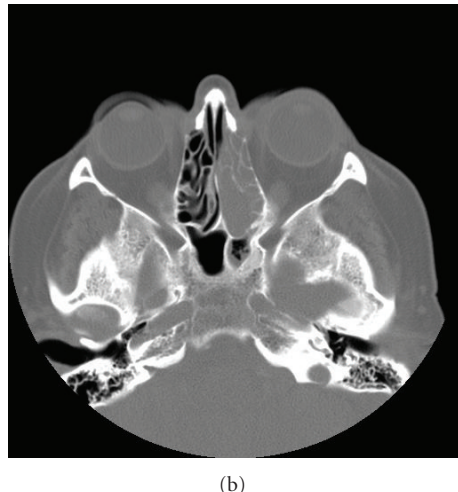
FIGURE 1: CT scans taken in 2006 after the patient's initial referral to ENT. (a) CT scan showing a mass in the left nasal cavity, and (b) CT scan showing the mass in the left ethmoid sinus, The mass was initially thought to be an inverted papilloma, but following histology it was shown to be an intestinal-type adenocarcinoma.