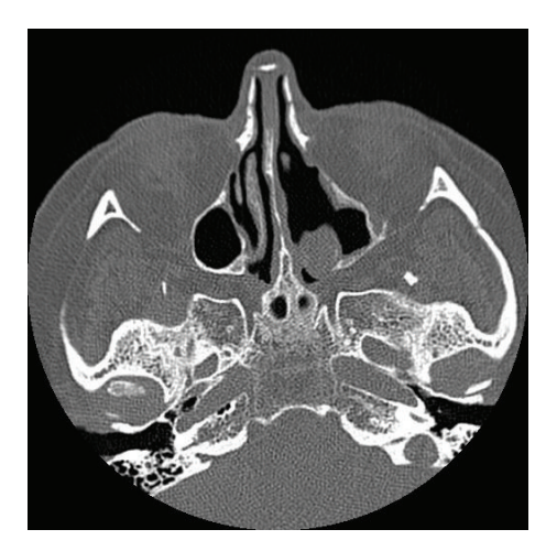
FIGURE 2: CT scan taken in 2007 showing evidence of surgery in the patient's left nasal cavity. The lesion has been removed, and the maxillary ostium is widened.

chemotherapy was again used in September 2008 to treat a recurrence of the tumour, located in the posterior ethmoidal sinus.