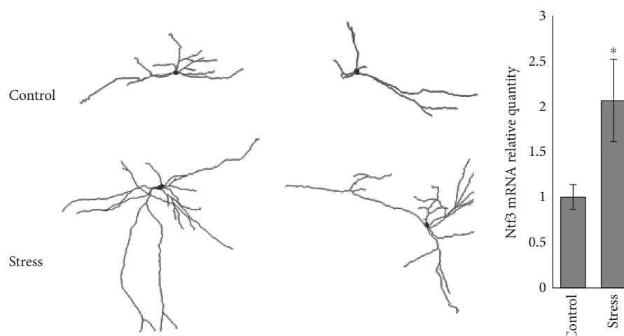
FIGURE 2: LC neurons from stressor-exposed animals show a trend for increased dendritic complexity. Representative traced neurons from control (top) and stressor exposed (bottom) animals filled with biocytin reveal a tendency for LC cells from stressed rats to possess larger and more complex dendritic arbors a week after stressor exposure. Additionally, neurotrophin 3, which promotes neurite outgrowth and dendritic proliferation, is upregulated in LC one week after stressor exposure. * p < 0.05 versus control.

suggests that the female LC might be subjected to greater afferent regulation by CRF and therefore more stress-responsive. This sexual dimorphism might provide a structural basis for differences in emotional arousal between sexes and the greater increased susceptibility of females to anxiety disorders [98]. Interestingly, in mice that genetically overexpress CRF, the complexity of male dendritic morphology increases to resemble the morphology of wild-type and CRF-overexpressing females. This further suggests that enhanced CRF signaling produces neurite proliferation and extension in LC [58]. Such observations provide further evidence for stress and CRF-induced central noradrenergic reorganization.