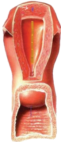
FIGURE 2: Illustration of the frameless GyneFix IUD anchored in the fundus of the uterus (see arrow). The anchoring knot is inserted in the fundus with a specially designed inserter.

the frameless IUD inserted in the uterus and Figure 3 shows the disparity in cavity width in two nulliparous women.