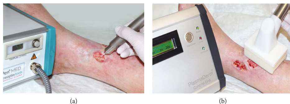
FIGURE 2: Treatment of chronic ulceration with cold atmospheric pressure plasma (CAP): (a) kINPen MED and (b) PlasmaDerm VU-2010.