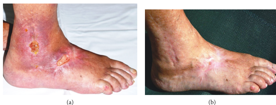
FIGURE 3: Example of successful wound healing after treatment with cold atmospheric pressure plasma (CAP): (a) chronic ulceration before CAP treatment and (b) complete healing for the first time since 14 years after CAP treatment for about 5 months.