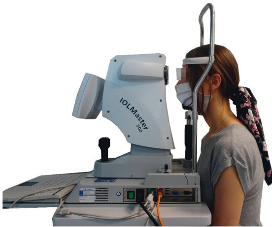
FIGURE 2: The axial length eyeball measurement during the study.

optically smooth tear film over the cornea. Five separate tests were performed to assess the average axial length [27].