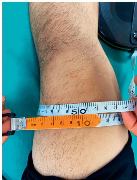
FIGURE 2: Therapist measuring the circumference of the patient's injured knee.

test group, and 67–132 were set as the control group. Eligible subjects who provided written informed consent were randomly assigned to a group. The envelopes were managed by an independent, blinded statistician who was not involved in participant recruitment, treatment, or assessment. Before the first treatment, the therapist opened the envelope of each eligible patient to determine which group they entered.