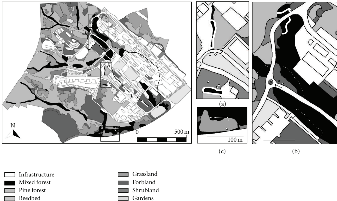
FIGURE 1: The University campus is composed by three main units. The first unit comprises all the university and transportation infrastructure like buildings, parkings, railway stations, roads, and paths. The agroforestry unit is composed by natural areas such as mixed and pine forests, shrubland, grassland and reedbed. Finally, the gardenized unit included grass areas with several isolated trees and bushes. The area of the campus invaded by L. neglectus is surrounded by a black line. On the right side, areas (a, b, and c) of the chosen invaded (dotted line) and control (continuous line) forest fragments have been enlarged. Isolated trees are shown with small white circles. The arrow, in figure (b) points a roundabout where there are five isolated trees colonized by L. neglectus .

explore the crown. Between late April and mid October, we recorded all ant species that were observed climbing all tree trunks, comprising in total 120 trees in invaded fragments and 78 trees in control fragments. We identified ant species foraging on tree trunks in the field, when possible, or we took samples for identification in the laboratory. Trees were observed between 9 h and 13 h (solar time) every 25 \pm 2 days, (mean \pm SE). Invaded fragments were surveyed in both years (2005 and 2006), while control fragments were surveyed in one year (2006).