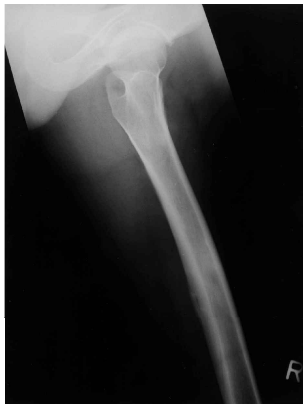
Fig. 1. Conventional radiograph of the femur shows generalized periosteal thickening with an area of bulging periosteum and a slight hypodense region within it. A soft tissue component is noted.

(2) A 27-year-old male patient was referred to our unit on October 1995 because of a painful growing mass in the medial aspect of his right thigh for 2½ months. His general condition was good. Physical examination showed a tender longitudinal lesion in the right mid-medial aspect of his thigh. There was no evidence of palpable lymph nodes in any locations. Blood tests, including ESR, WBC count, AP and LDH, were all normal. Conventional radiograph of the femur showed generalized periosteal thickening, with an area of bulging periosteum and a slight hypodense region within it. A soft tissue component was noted (Fig. 1). Our differential diagnosis was either a soft tissue tumor encroaching upon the bone or a malignant surface bone neoplasm. Staging studies included plain chest X-ray film; total body bone scan; CT of the lesion and chest and MRI of the lesion. As in the previous case, the CT and MRI of the thigh showed a periosteal/surface lesion without any involvement of the medullary canal (Fig. 2). Systemic bone