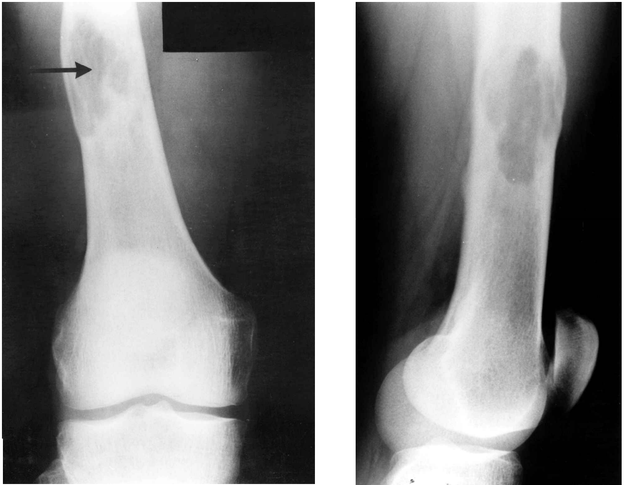
Fig. 1. Plain radiographs of the lesion in the femur (IA antero-posterior view; IB lateral view).

performed. The patient remained disease free for 3 years, but subsequently developed metastases that led to his death 6 years from the time of initial presentation.