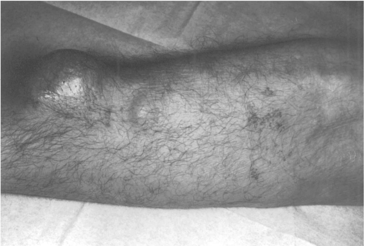
Fig. 1. Appearance of the tumour at presentation.