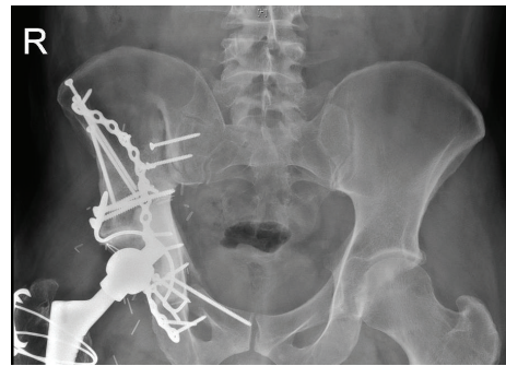
FIGURE 3: Patient number 4 had poorer functional outcome (MSTS 57). This may be accounted for by the higher level iliac resection and more extensive stripping of the abductor musculature.

important for soft tissue coverage and prevention of infection and joint stability and function.