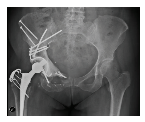
FIGURE 2: Postoperative X-ray at 6 months. Asymptomatic nonunion is seen at the ischial and pubic osteotomies. The configuration of screws and plates and screws through flanged acetabular cages was variable between cases.