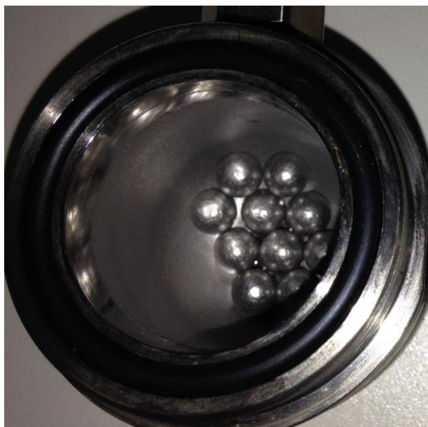
Figure S1. Direct ball milling of the mixture of raw metals of Ti, V, etc. will result in sticking of the sample to the vessel wall and milling balls. No powders can be collected after ball milling for 2 to 24 hours.

*Corresponding author: hshao@umac.mo (H. Shao), hjlin@jnu.edu.cn (H. Lin)