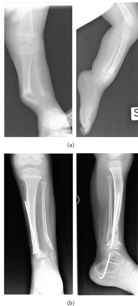
FIGURE 2: Clinical effect of the use of combined BM hMSC-based technique. Radiographics of a representative patient affected by NF1 with a tibial pseudarthrosis before (a) and three months (b) after the use of autologous BM hMSCs combined with platelet-rich fibrin and lyophilized bone.

Cartilage is vulnerable to injury and has poor potential for repair. However, unlike bone, cartilage regeneration remains elusive. Procedures devoted to recruit stem cells from BM by penetration of the subchondral bone have been widely used to treat localized cartilage defects [111–113]. More recently, autologous chondrocyte implantation, alone or in combination with MSCs, has been introduced [111]. The use