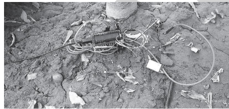
FIGURE 3: Soil sensor node.