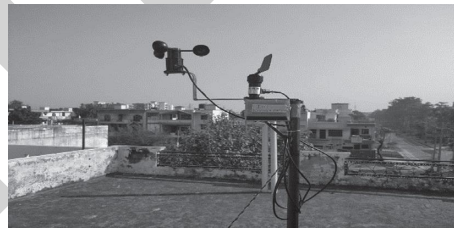
FIGURE 4: Weather station.