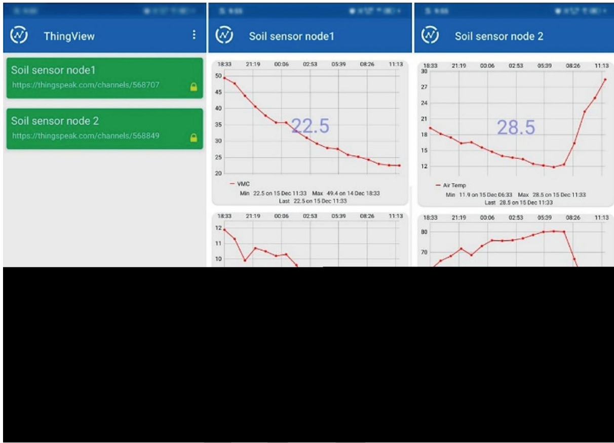
FIGURE 5: ThingSpeak data visualization interface on mobile phone.