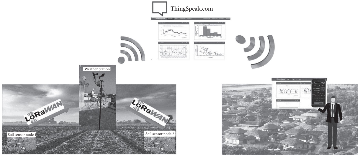
FIGURE 2: Block diagram of the proposed irrigation system.