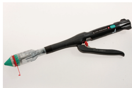
FIGURE 2: CPH34 HV.

described [13]. Clinical follow-up consisted of outpatient visits that were scheduled at six and 12 months after the operation, as soon as the complete healing was achieved. Residual prolapse was defined as the reduction, without disappearance, of prolapsed tissue (haemorrhoids and/or rectal prolapse) within six months after the operation; recurrent disease was defined as the reappearance of prolapsed tissue after a symptom-free period of at least six months. Each patient gave his/her written informed consent and the study protocol was submitted to the Ethic Committee approval. All patients underwent clinical examination six and twelve months postoperatively in the outpatient clinic.